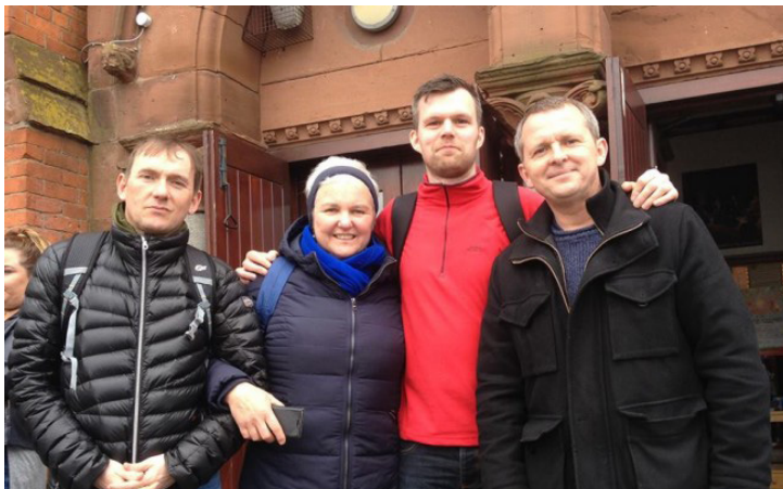
Richard Boyd Barrett TD Brid Smith TD & Gino Kenny TD

A hundred years of failed establishment politics and broken promises is more than enough. People Before Profit are proud to provide a socialist alternative fit for our lives in the 21st century.